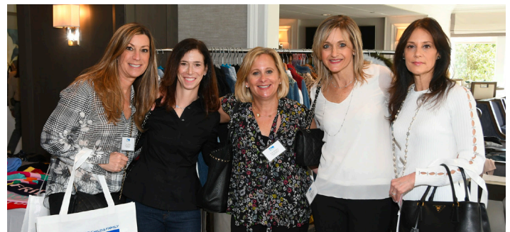
Shoppers visiting the boutiques.