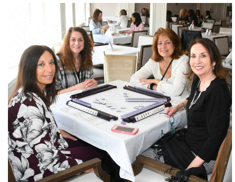
Mahjong was the favorite game for these guests at our Spring Luncheon.