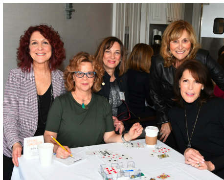
Canasta players enjoying the Spring Luncheon.