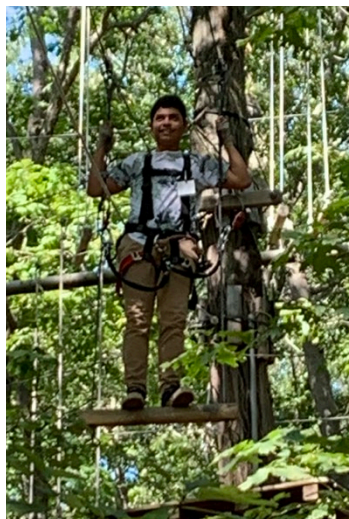
The boys braved the rigorous course and made it to the top!