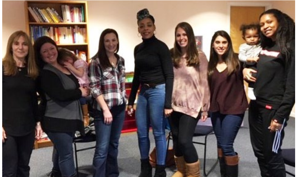
Clients are all smiles after taking part in our wellness program!