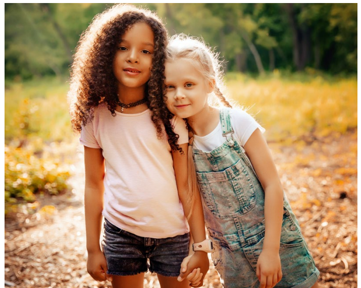
Blog: Teach Your Children About Racism