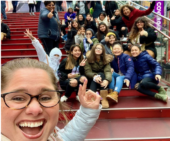
Our teens and staff were all smiles as they waited for the play to begin.

This past winter, the teens who take part in our Latina Girls Project outings were thrilled to be on Broadway to see Ain't Too Proud: The Life and Times of the Temptations . Though they're too young to know the music, they loved the story of young people having a dream and pursuing it—just as we hope for our girls!