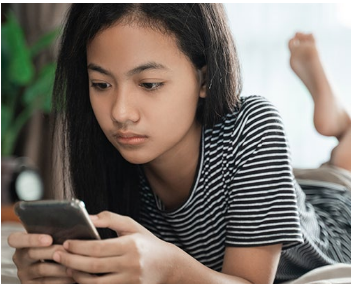
Blog: Living Off-Screen During Quarantine?

Visit www.northshorechildguidance.org/blog/ or www.facebook.com/nscfgc to check out the latest!