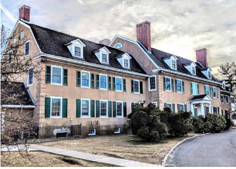
Our beloved Whispered Wishes headquarters

Some six years ago, North Shore Child & Family Guidance Center launched a major Capital Improvements Campaign, dubbed Let the Light In, to raise money for much-needed renovations and repairs to our main headquarters in Roslyn Heights. Our historic 115-year-old building, known as Whispered Wishes, welcomes thousands of children and families each year, and the importance of making it a friendly and secure environment cannot be overstated.