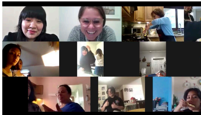
The girls and staff from our Latina Girls Project joined for a virtual event to celebrate the holidays.