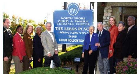
2007 The Leeds Place renaming, with Staff and Board

We are grateful to have been serving Long Island families for the past 70 years thanks to our generous supporters and dedicated staff.