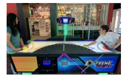
The girls enjoy cooking and games