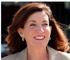
Governor Kathy Hochul

On June 15th, NY Governor Kathy Hochul convened the first-ever Youth Mental Health Summit! The Guidance Center was excited to participate in the event, held at the Javits Center in New York City, to provide input, and advocacy, and to learn about the opportu-