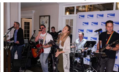
Peat Moss and The Fertilizers