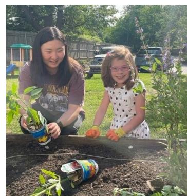
Kids work on the organic garden