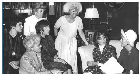
Mary Tyler Moore joined the Board of Directors, bringing more awareness and support to the Guidance Center's mission