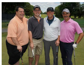
Gilman Management Foursome