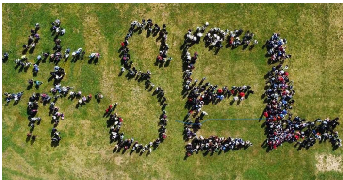
Drone photo of Westbury students in a #SEL formation

outdoor SEL Fun Day on May 25th. Students shared a sense of community in their SEL t-shirts as presenters engaged the scholars in interactive discussions and activities about various SEL themes. The day culminated with a drone photo of the students on the field spelling out the letters "S-E-L".