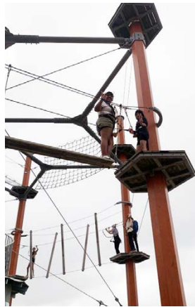
The girls get adventurous.